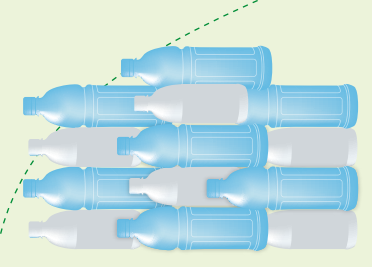
are put together into a bale